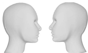
Right View Left View